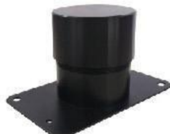
5° Reflectance Accessory Cat.No.:1102900940

Can test 5 sample at the same time, light path from 10-100mm adjustable.