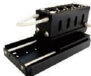
10mm Water-Jacked 4-cell holder Cat.No.:1102900610

Special measuring accessories for measuring \leq 200\mu\text{l} capacity.