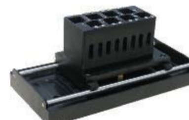
Automatic 8-cell Holder Cat.No.:1102900310

Test 8 samples at same time, can improve work efficiency.