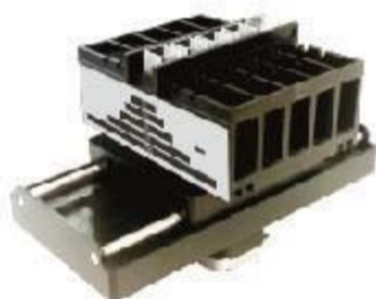
10-100 mm Automatic 5-cell Holder Cat.No.:1220000100

Can test 5 sample at the same time, light path from 10-100mm adjustable.