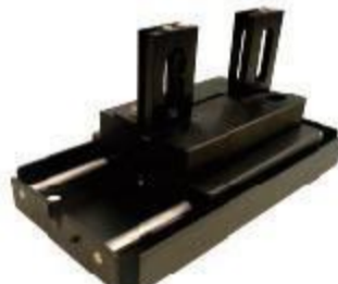
Solid sample 2-position holder Cat.No.:1102900450