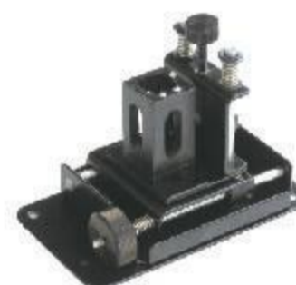
Micro Cell Holder Cat.No.:1102900240

Special measuring accessories for measuring \leq 200\mu\text{l} capacity.