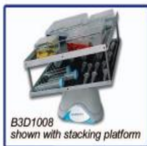
B3D1008 shown with stacking platform

Modeled after our popular BioMixer series of "nutating" shakers, these platform rockers provide the perfect 3-dimensional motion for all blot related applications. Their tilt angle and speed have been optimally set for gentle, but thorough mixing in gel trays, boxes and other flat vessels.