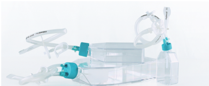
Cell Culture Flask Closed System Solution