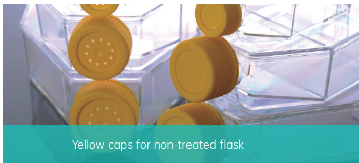
Yellow caps for non-treated flask