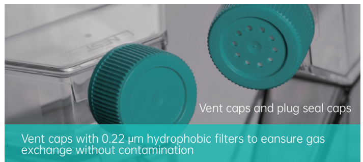
Vent caps and plug seal caps