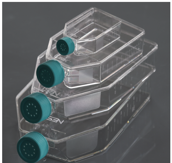
Cell Culture Flask