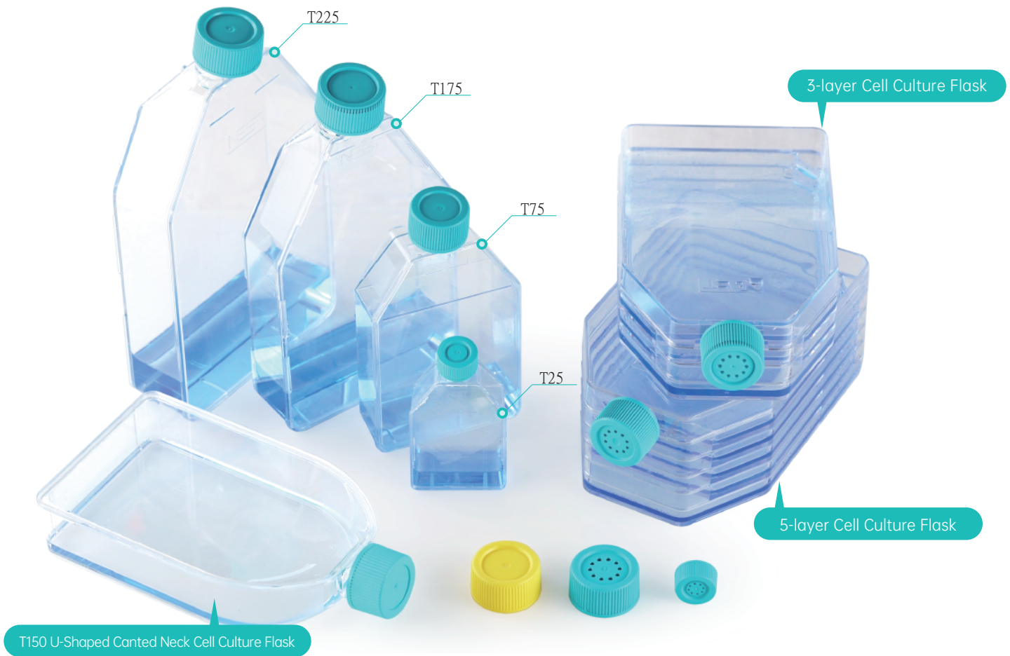
T150 U-Shaped Canted Neck Cell Culture Flask