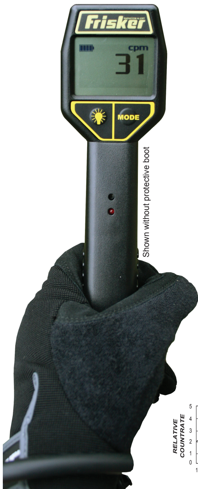
Shown without protective boot