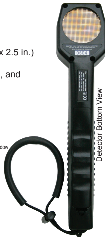
Detector Bottom View