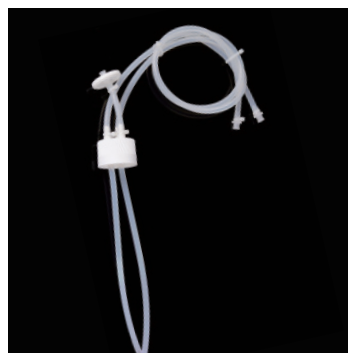
3-Port Transfer Cap