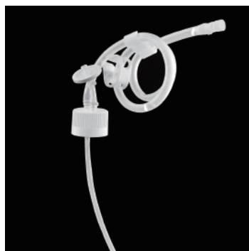
Bi-Directional Transfer Cap