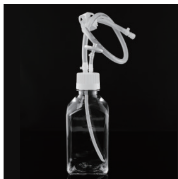
Closed System Solution(Bi-Directional Transfer Cap)