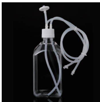
Closed System Solution(3-Port Transfer Cap)