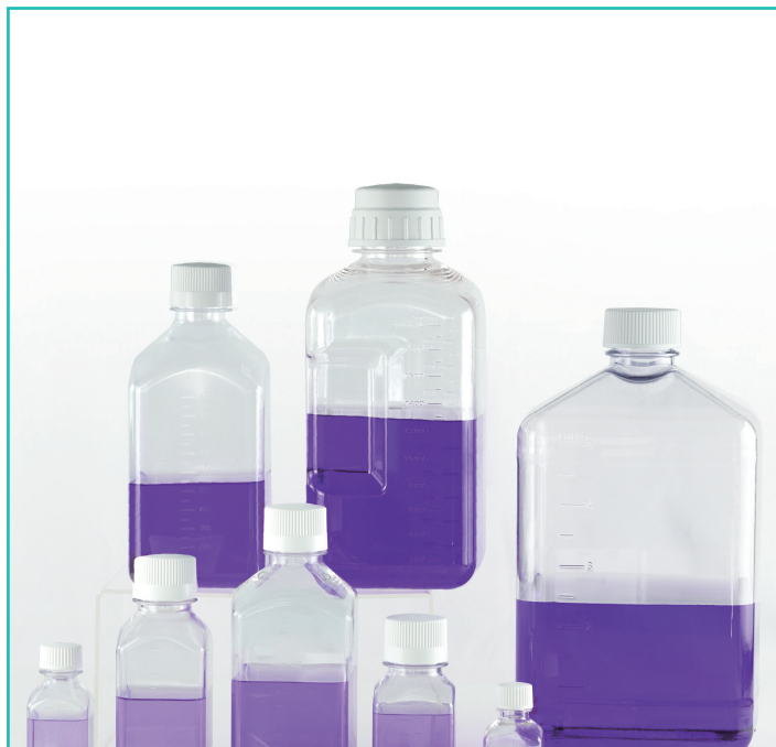
Square Storage Bottle