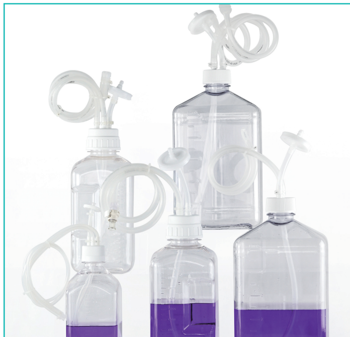
Square Storage Bottle Closed System Solution