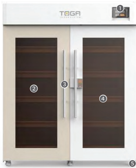
TOGA® Safe Smart (Double-Door)

Equipped with TOGA® filter technology to remove toxic gases generated from reagents stored inside the cabinet. Completely closed structural design ensures toxic fumes and noxious odors stay inside the cabinet to be purified by the TOGA® filters. External contaminants, such as dust, cannot enter the cabinet, extending filter life. IoT system manages and monitors reagent use in real time. The complete filtered storage solution for your laboratory.