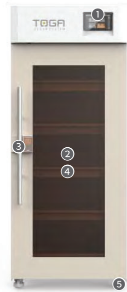
TOGA® Safe Smart (Single-Door)