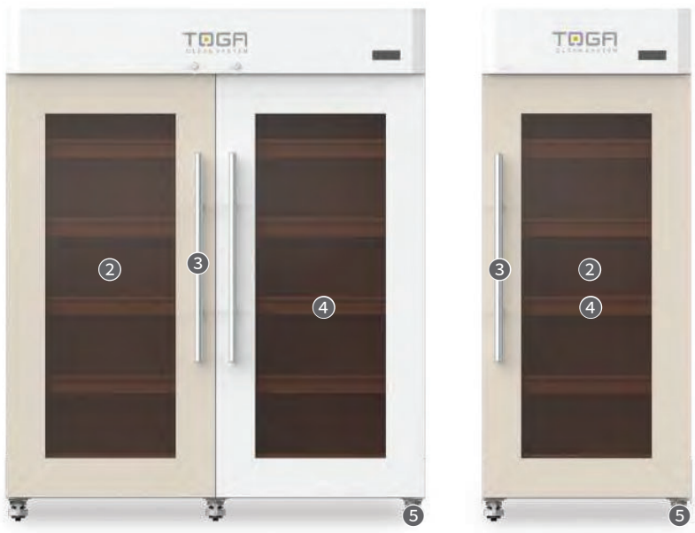
TOGA® Safe Smart (Double-Door)

Equipped with TOGA® filter technology to remove toxic gases generated from reagents stored inside the cabinet. Completely closed structural design guarantees that toxic fumes and noxious odors do not leave the cabinet and extends filter life.